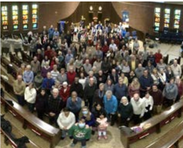
Our 70 th Anniversary Group Picture